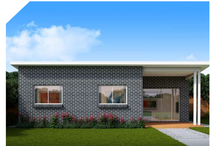
FACADE STYLE D

Items may be displayed in our homes that are not included in our standard specifications. Display Home Options, including façade upgrades, window upgrades, brick upgrades, kitchen and bathroom upgrades, light fittings, down lights, feature walls, upgraded tiling, floor coverings, window coverings, all external landscape including retaining walls, timber porch and patio, decking, pergolas, rainwater tanks are not included. Unless noted, no concrete slab or pad provided to any external area. All point of sale and marketing material are for illustrative purposes only and it is the client's responsibility to satisfy themselves as to their understanding. Champion Homes gives no warranty and make no representation as to the accuracy or sufficiency of any description, illustration, photograph or statement contained in this document and accepts no liability for any loss which may be suffered by any person who relies either wholly or in part upon the information presented. Photographs and illustrations in this brochure are intended to be a visual aid only. All information provided is subject to change without notice. Floor plan size may vary according to facade selected. Copyright© This plan is the property of Champion Homes and may not be used in whole or part. Legal action will be taken against any person who infringes the Copyright. January 2020. * All drawings and images are for illustrative purposes and are used as a visual guide only.